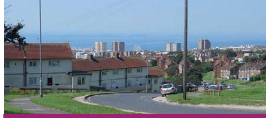
Looking over Craven Vale, one of the many images used in the book

The remaining two sections cover reminiscences of some of the earlier residents of the Craven Vale Estate, still living there. Their fascinating stories are