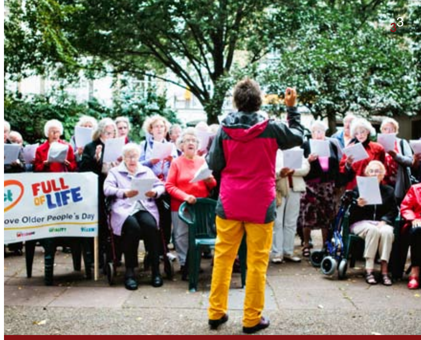
The Sing for Better Health group at Older People's Day (see ad on p11).

We know that many who attended the awards event thoroughly enjoyed themselves and we are absolutely delighted that so many older people received well-deserved recognition for their incredible achievements. On the other hand, some of the events away from the City Centre were not wellattended, or, if they were were, they were attended by people who would have been at that location anyway! And some representatives of organisations have said it was a shame that they were not given more warning of the event so that they could contribute more. Lessons, then, for next year! And that's where we need your views!